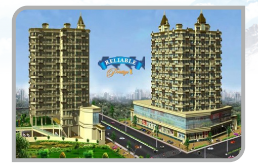
Reliable Prestige 1